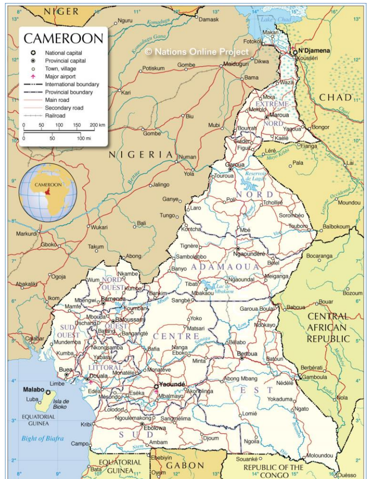
Map of Cameroon. Cameroon has a population of nearly 26 million, 57% of which live in urban areas. Western and northern areas have the highest concentrations of people, while the eastern and southern areas are more sparsely populated.